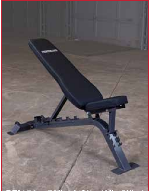
PFI150 (55"L x 24"W x 18"H, 53lbs.)

All Powerline items are protected by our newly-expanded Minimum Advertised Pricing (MAP) program, designed to eliminate price erosion and offer a fair and level playing field for all stores and websites.