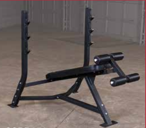
SODB250 DECLINE BENCH

Body-Solid has retooled our Pro Clubline offerings with four new fixed Olympic benches (a flat bench, an incline bench, a decline bench and a shoulder press bench). These benches are full commercial and recommended for heavy-use facilities.