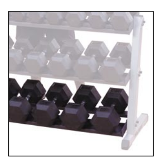
GDRT6 (Shown in photo) Optional Third Tier